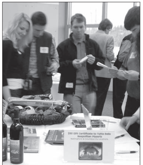
Guests move in on silent auction items