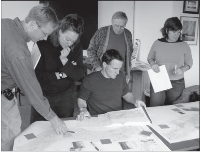
Identifying potential public access improvements on the Green/Duwamish River

recreation is growing. Washington Water interpret the natural and cultural features of Trails Association has been working on two Lake Union and Portage Bay shorelines and projects that will highlight public access highlight public access. in King County. The first is the Green-Duwamish River Mapping Project, extending from Kent to Elliott Bay, and the second an interpretive map of the Lake Union and Portage Bay portions of the Lakes-to-Locks Water Trail in Seattle.