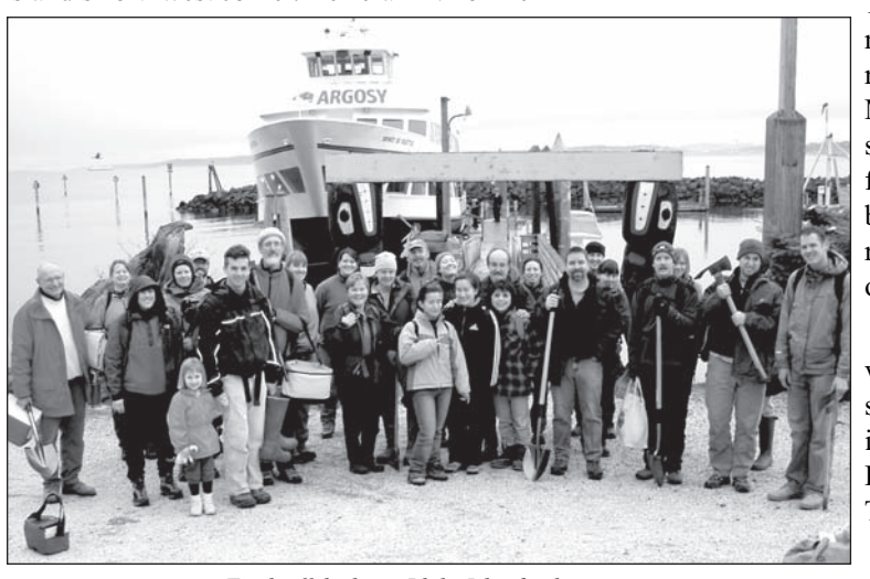
Fresh off the boat: Blake Island volunteers