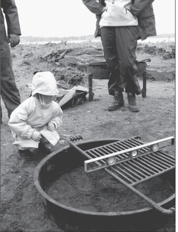
The youngest volunteer does quality control on a new fire ring

The large-scale work party was made possible thanks an REI conservation grant, help from Tillicum Village, and partnership with Washington State Parks.