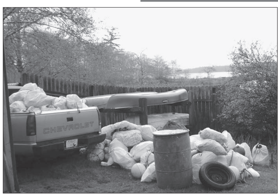
A portion of the trash removed from Ozette beaches and lake shore.

Details & Registration: www.wwta.org/rendezvous