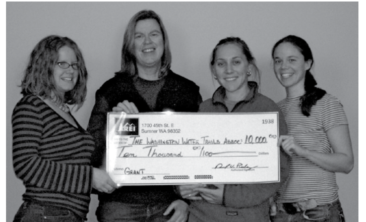
WWTa Staff with the "Big Check"

natural shorelines of Washington State, and will educate future advocates for public access to Washington waters. Thanks to REI employees for their continuing support of WWTa!